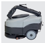
Handle folds flat for ease of storage